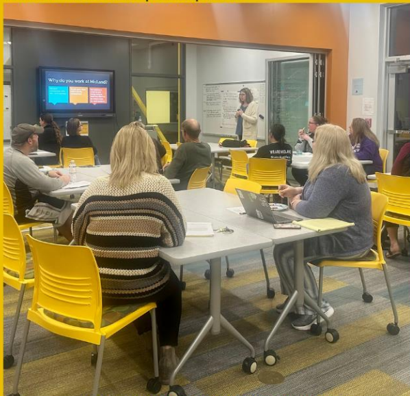
SCHOOL IMPROVEMENT ADVISORY COMMITTEE - THANK YOU FOR YOUR SERVICE!

On October 19th, the Midland administration team were joined by community members, parents and staff to review district student data and collaborate on school goals. Great ideas were generated on how to reach out to the Midland Community of learners. Great ideas generated were Before/After School Daycare, Welcome Baskets at City Halls, Leader in Me Days, Movies & Popcorn Events for Families, Town Nights at Ball Games and more! A huge THANK YOU to all participants!