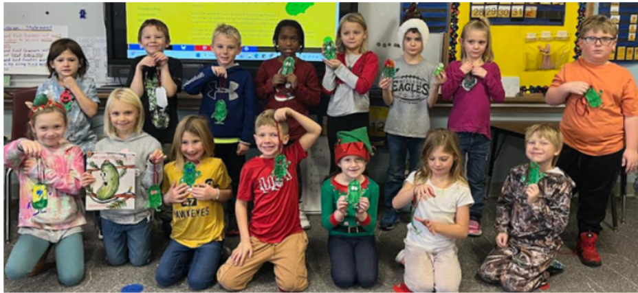
The Christmas Pickle, a legend from Germany